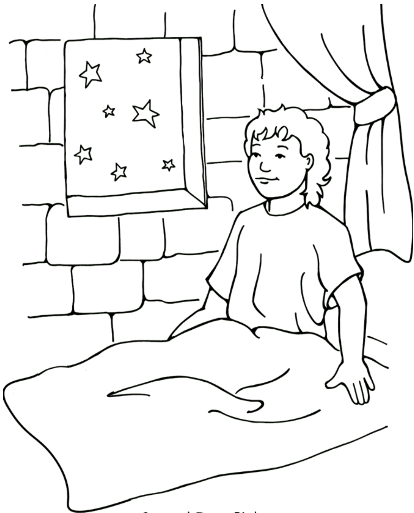
Samuel Does Right 1 Samuel 2-4, 7